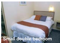
Small double bedroom